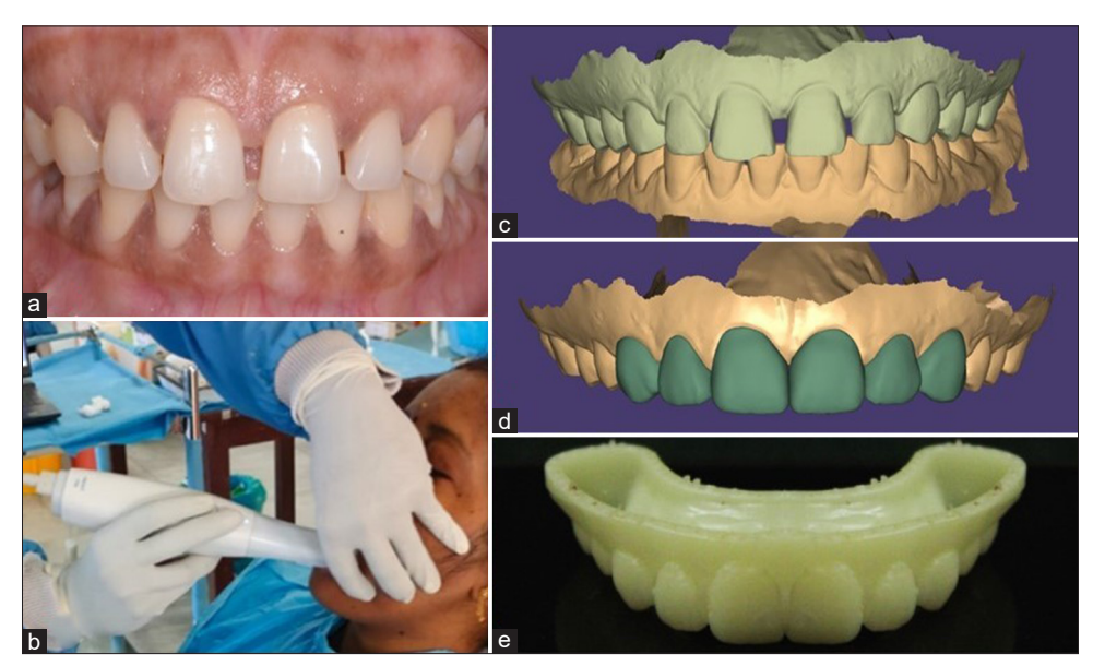
Figure 2: (a) Pre-operative occlusion evaluation, (b) intra-oral scanning, (c) scanned data, (d) digital smile designing, and (e) 3D printed mock-up.

occlusion. Surface treatment was carried out on veneers of LiDi by application of 9% hydrofluoric acid for 20 s, rinsed, and dried [Figure 4a and b]. This was followed by acid etching with 37% phosphoric acid for 60 s, rinsed, and dried [Figure 4c]. Silane was applied to the intaglio surface of the veneer for 60 s [Figure 4d-f]. Simultaneously, the tooth surface was etched with 37% phosphoric acid for 30 s, rinsed, and dried [Figure 4g and h]. A bonding agent was applied with a micro brush [Figure 4i]. LiDi veneer cementation was done using resin cement (G-Cem linkforce, GC) [Figure 5a-d]. Post-operative instructions were given.