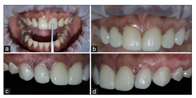
Figure 5: (a) Veneers transferred to the teeth using sticky applicator tip, post-operative (b) frontal view, (c) right lateral view, and (d) left lateral view.

During the 1-week follow-up, the patient gave positive feedback, there were no extra-oral abnormalities, the intra-oral examination revealed good color stability of the veneers, and the gingival health was optimal [Figure 6a-d].