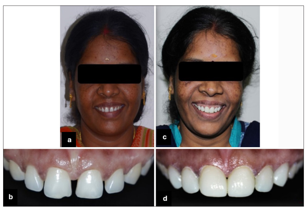
Figure 6: Pre-operative (a) face, (b) teeth, post-operative (c) face, and (d) teeth.