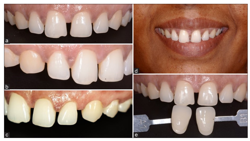
Figure 1: Pre-operative (a) frontal view, (b) right lateral view, (c) left lateral view, (d) smile line evaluation, and (e) shade evaluation.