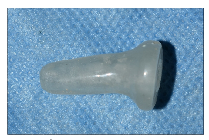
Figure 4: Nasal stent.

done using auto-polymerizing resin (Auto-polymerizing polymethyl methacrylate [PMMA] resin – DPI-RR cold cure, India). The wire was removed and the hole dimensions were increased. It was trimmed and highly polished [Figure 4] and cleaned with a disinfectant (10% aqueous solution of povidone-iodine - Betadine) before inserting in the nares. The fit was tight and it was self-retentive [Figures 5 and 6].