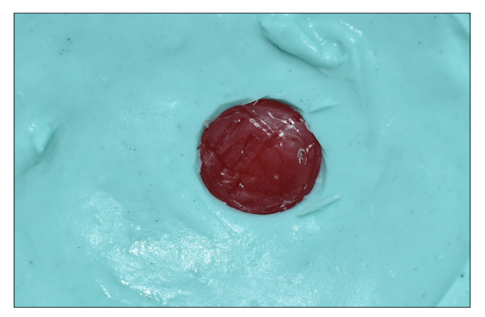
Figure 2: Alginate duplication.