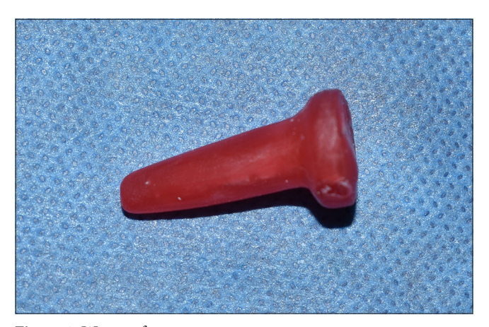
Figure 1: Wax conformer.