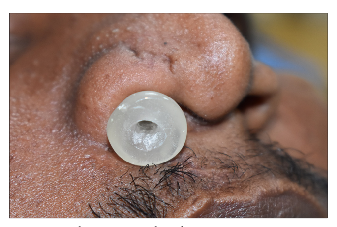
Figure 6: Nasal stent insertion lateral view.

patient comfort throughout recovery. To achieve these goals, custom-fabricated stents, typically made of acrylic or silicone, are often employed. Hard acrylic resin stents are especially favored for their versatility - they can be meticulously sculpted, easily adjusted, and refined to a smooth surface, making them well-suited for delicate nasal anatomy. [6]