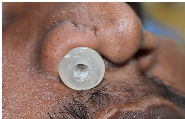
Figure 6: Nasal stent insertion lateral view.

patient comfort throughout recovery. To achieve these goals, custom-fabricated stents, typically made of acrylic or silicone, are often employed. Hard acrylic resin stents are especially favored for their versatility - they can be meticulously sculpted, easily adjusted, and refined to a smooth surface, making them well-suited for delicate nasal anatomy. [6]