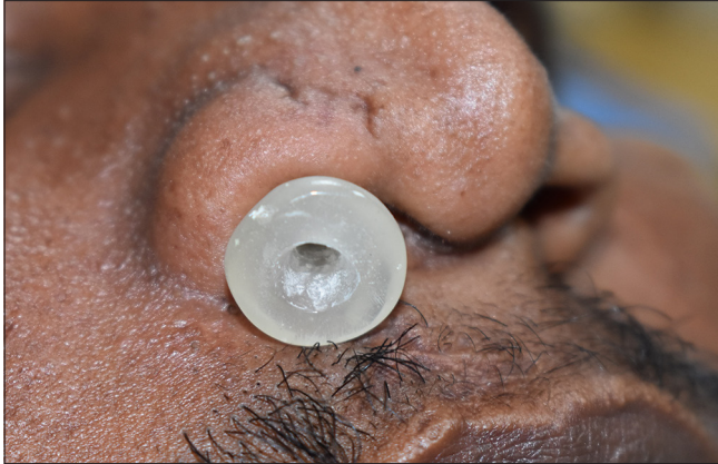
Figure 6: Nasal stent insertion lateral view.

patient comfort throughout recovery. To achieve these goals, custom-fabricated stents, typically made of acrylic or silicone, are often employed. Hard acrylic resin stents are especially favored for their versatility - they can be meticulously sculpted, easily adjusted, and refined to a smooth surface, making them well-suited for delicate nasal anatomy. [6]