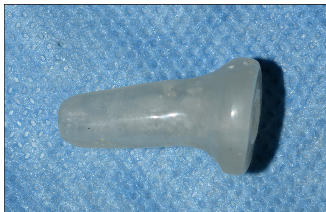
Figure 4: Nasal stent.