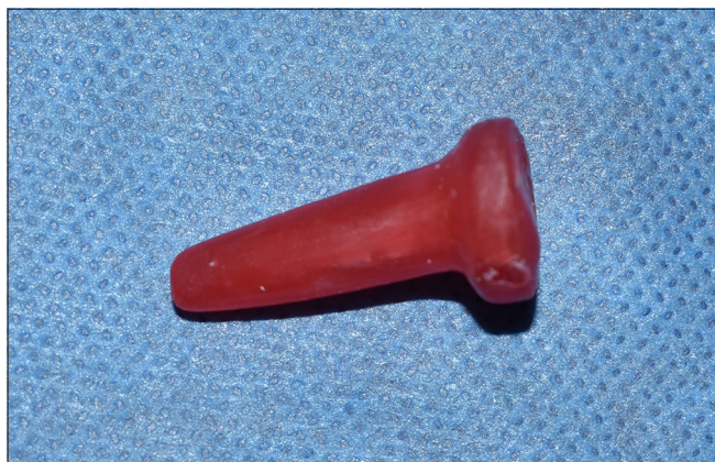
Figure 1: Wax conformer.