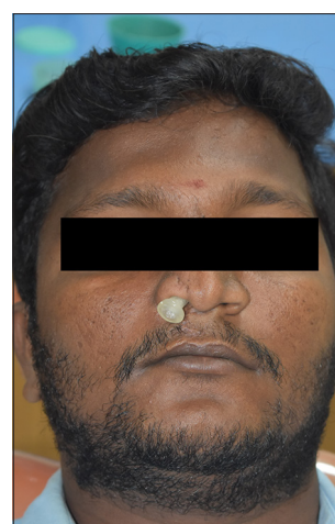
Figure 5: Nasal stent insertion frontal view.

done using auto-polymerizing resin (Auto-polymerizing – polymethyl methacrylate [PMMA] resin – DPI-RR cold cure, India). The wire was removed and the hole dimensions were increased. It was trimmed and highly polished [Figure 4] and cleaned with a disinfectant (10% aqueous solution of povidone-iodine - Betadine) before inserting in the nares. The fit was tight and it was self-retentive [Figures 5 and 6].